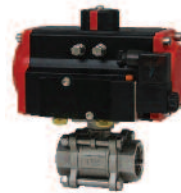
Model SN mounted to an actuator