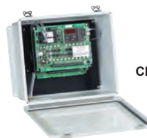
Master Board Stacked with Channel Expander.